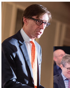
German Ambassador Dr. Peter Wittig addresses the German Chancellor Fellows