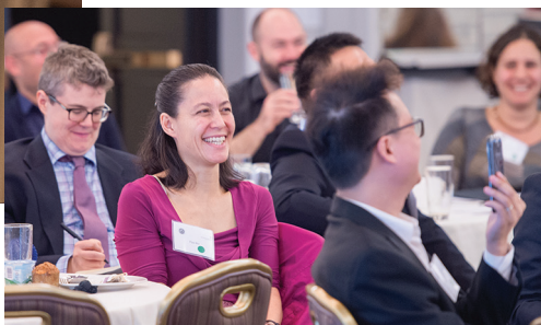
German Chancellor Fellows at the Second Triennial Alumni Meeting in Washington, DC