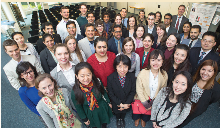
The 2016 Class of German Chancellor Fellows