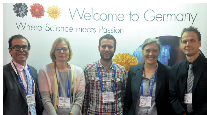
The Research in Germany Team at the ACS Annual Meeting

American Friends' last two promotional activities for 2016 will be the Society for Neuroscience Meeting in San Diego from November 12–14 and the American Geophysical Union Meeting in San Francisco from December 12–16.