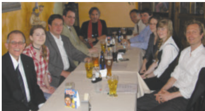
“Form and Meaning in Latin Drama” Conference Participants